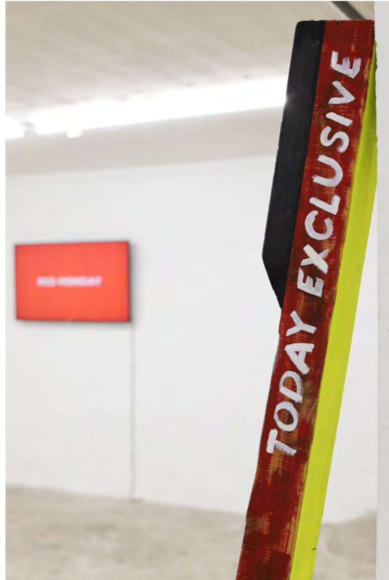
Magic Stick: News Alerts 2022 painted wood, 160 x 9 x 9 cm, unique piece