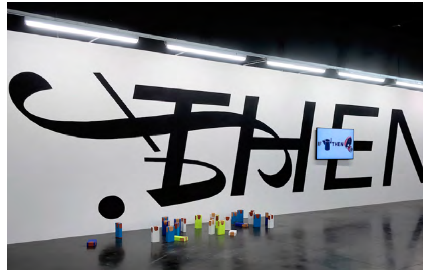
Tank Top 2024 brick, paint, 22 x 11 x 5 cm, unique work in a series of 26 pieces